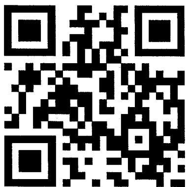
Alden Primary PTO Remind App

PTO Meeting - Primary School Refreshments will be provided!